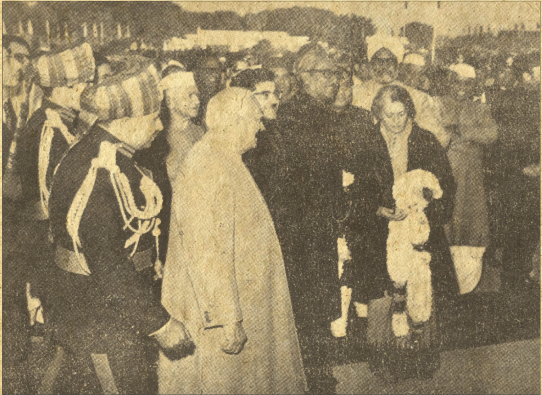
The Bangabandhu with Indian leaders