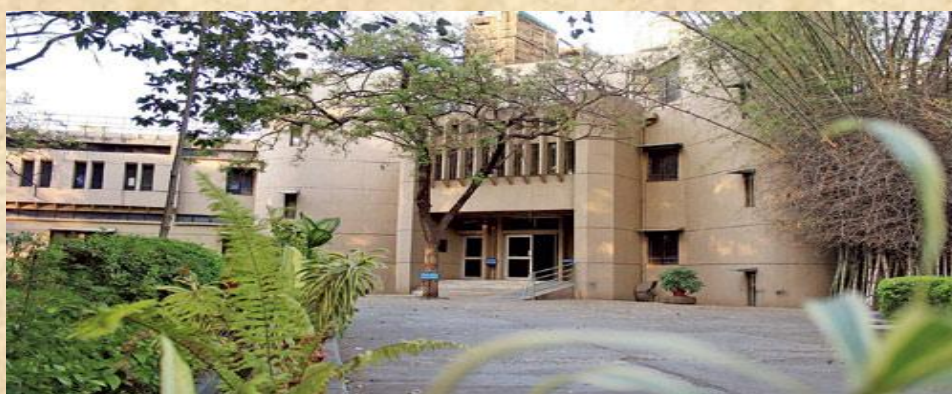
National Film Archives, Pune

National Film Archive of India was established in February 1964 as a media unit under the Ministry of Information and Broadcasting. The primary charter of NFAI is to safeguard the heritage of Indian Cinema for posterity and act as a centre for dissemination of a healthy film culture in the country. Promotion of film scholarship and research on various aspects of Cinema to make it more visible across the globe is another declared function of the Archive. NFAI has been a member of the International Federation of Film Archives since May 1969, which enables it to get expert advice and material on preservation techniques, documentation etc. The Archive has its own film vaults designed according to international film preservation standards.