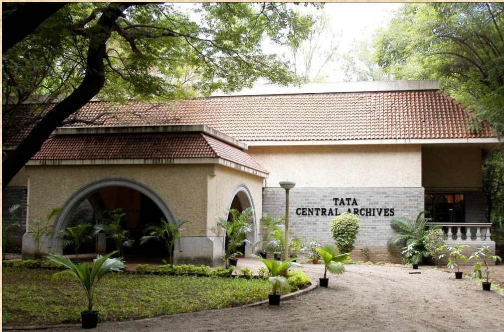
Tata Central Archives, Pune

The archives also have a sizeable number of documents on Indian industrialisation and correspondence with national leaders such as Dadabhai Naoroji and Mahatma Gandhi. This material is of tremendous use to researchers and historians who are able to access the preserved records of past. For instance, the oldest documents in the archives are the annual reports of Jamsetji Tata's first venture, the Central India Weaving and Manufacturing Company Ltd., dating back to 1875.