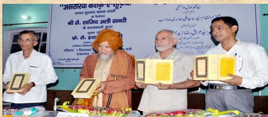
Book Release of Asrariya Kash-i-Sufia

The Rampur Raza Library is a treasure house of Indo-Islamic learning and arts which was set up by the erstwhile Rampur State and was founded by Nawab Faizullah Khan in 1774. His personal collection of valuable manuscripts, historical documents, Mughal miniature paintings, books and other works of art kept in the Nawab's Toshakhana formed the nucleus of the library. He also substantially added to this collection by subsequent acquisition. Among the later Nawabs, Nawab Kalbe Ali Khan (1865-87) acquisition of rare manuscripts and paintings enormously enriched the library collection.