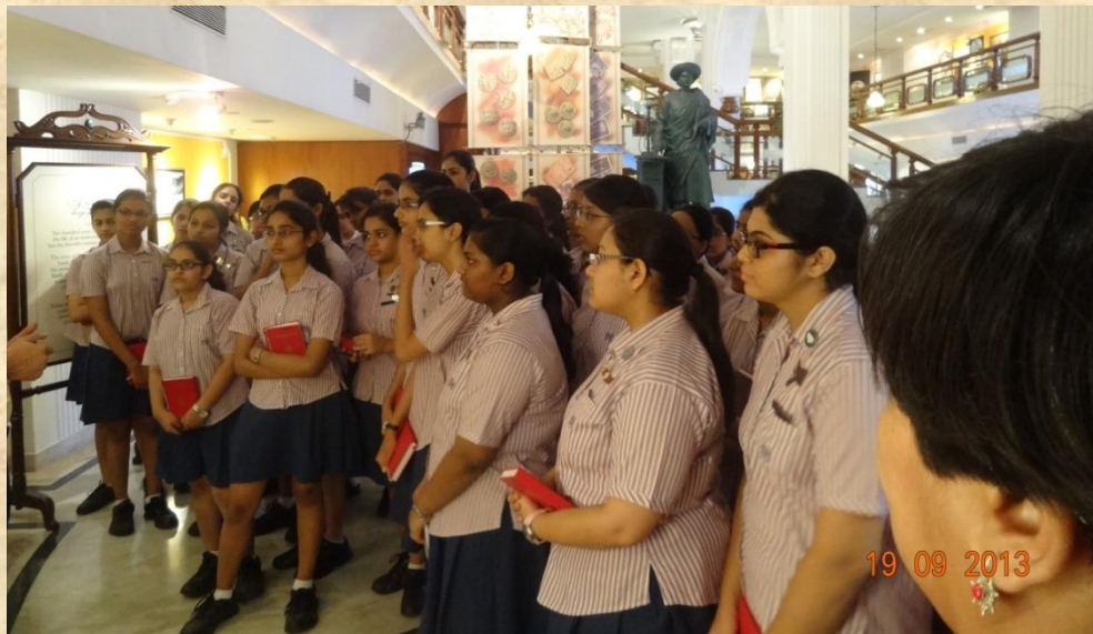
School children visiting State Bank Archives and Museum

State Bank Archives & Museum remained opened to visiting public on the four designated days all through the period (Tuesdays through Fridays between 2.30 and 5.00 in the afternoon on all the working days of the Bank) and for its own employees on all the days. Many trainees and new recruits to the Bank besides numerous officials, serving and retired visited the Museum during this period. Among them, mention could be made of the visit